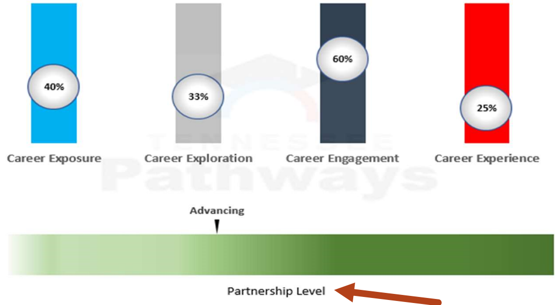
WBL by Category